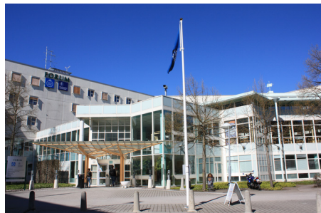
Department of Computer and System Sciences in Kista