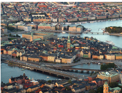
Skyveiv over Oldtown in Stockholm

At large, the HiNC series of conferences provides a vehicle for bringing together Nordic collective memory regarding development of hardware and software as well as methodology and areas of usage of computers. However, while development of technology is fairly well documented, less is written about the development of its use and about the ways in which ICT usage and users are affected by the technical development.